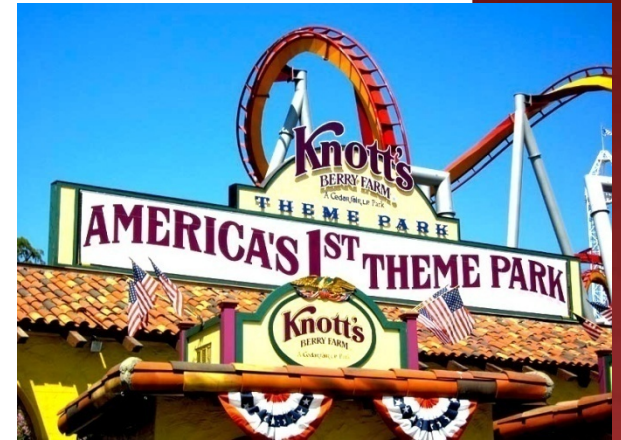
Knott's Berry Farm