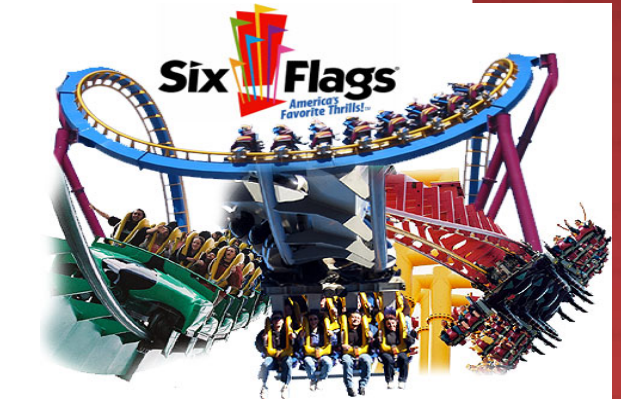
Six Flags Magic Mountain