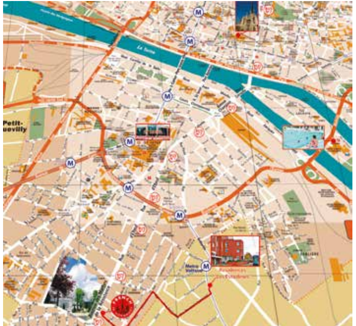
City Map showing FIN

Because we don't just say we care, we really do!