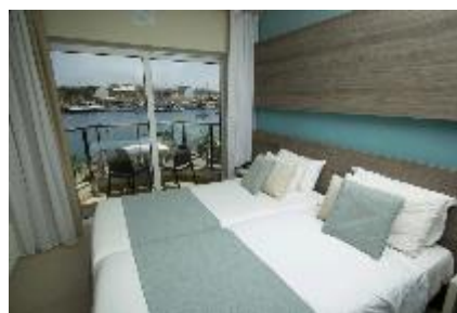
115 THE STRAND HOTEL