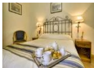
KENNEDY NOVA HOTEL