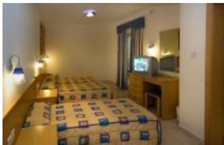
BAY VIEW HOTEL