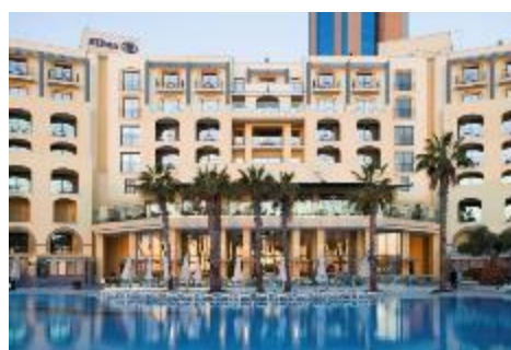
The Hilton Hotel

Students from 18 years old will be required to pay an Environmental Contribution amounting to €0.50c per night up to a maximum of €5 for each continuous stay in the Maltese Islands.