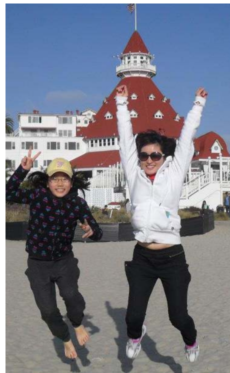
"Hotel Del" on Coronado Island