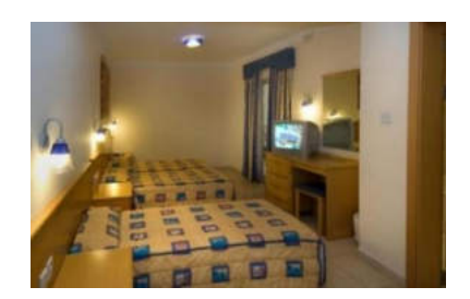
BAY VIEW HOTEL