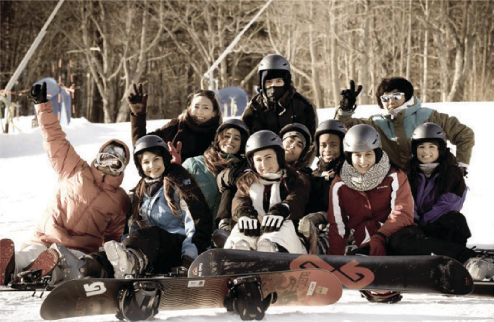
Skiing & Snowboarding at Mt. Sunapee, NH. Winter