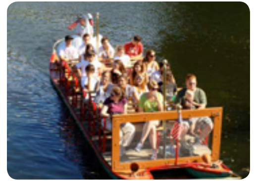
Swan Boats, Boston Public Garden

BSML students can choose from a variety of activities designed to suit the needs of every age group, whether they be business executives, university students, youth groups or families.