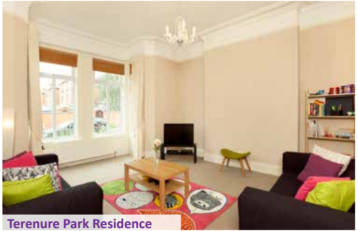
Terenure Park Residence