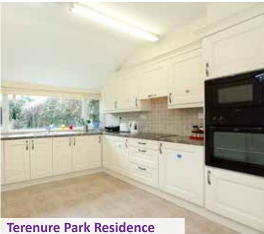
Terenure Park Residence