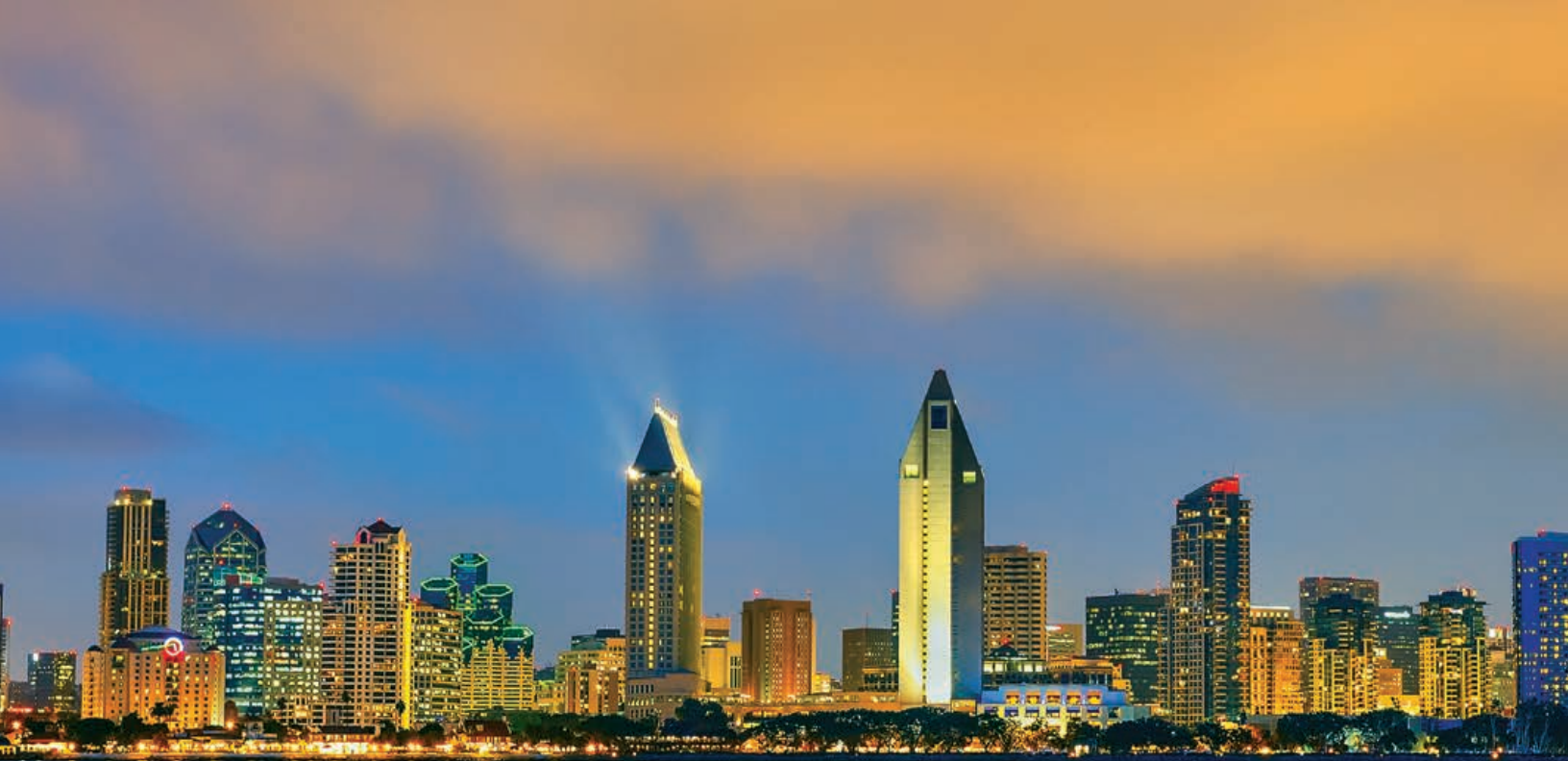
San Diego downtown skyline

UC San Diego Extension is a proud member of the UC Extension International Programs Consortium. UC San Diego ELI is a member of the American Association of Intensive English Programs and accredited by the Commission on English Language Program Accreditation. Not printed at state expense