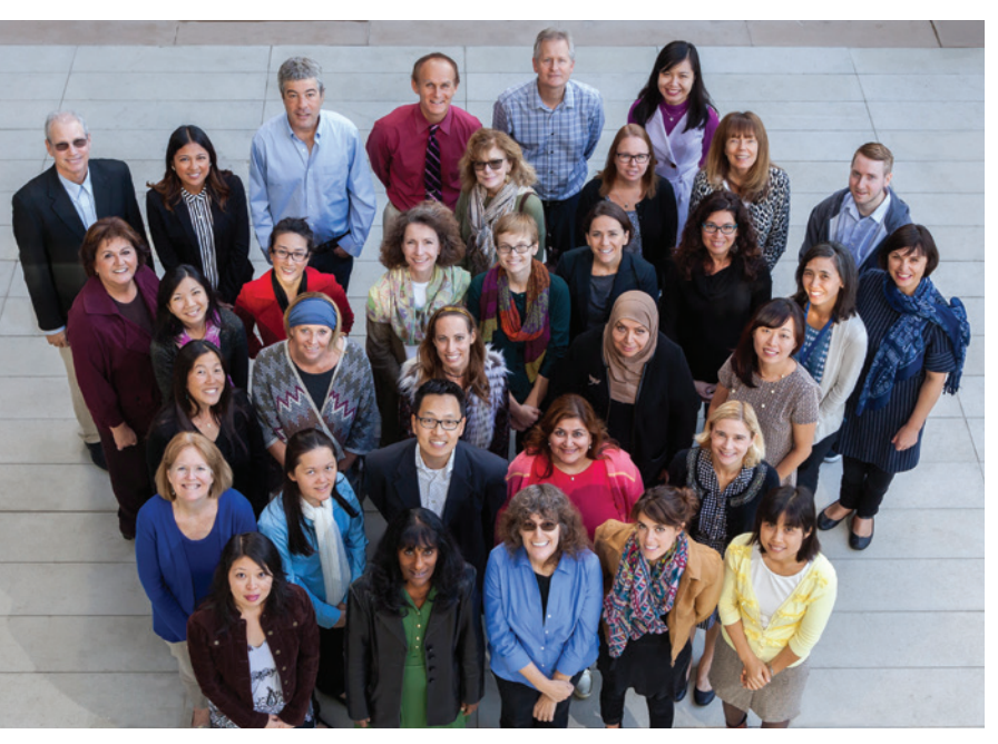
UCI ESL instructors and TEFL trainers.

If you want to enhance your professional teaching goals or are already enjoying a career teaching English, select UCI's certificate programs, ACP Teaching English as a Foreign Language (TEFL), or our custom-designed English-Mediated Instruction (EMI) program.