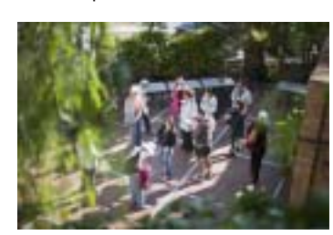
Entrance patio (2)