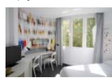
Executive room: Flow & Art