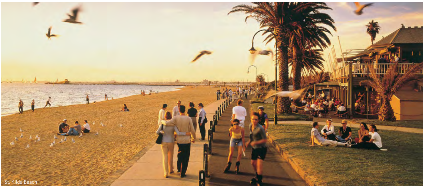
St. Kilda Beach

* All costs are indicative only and in Australian dollars.