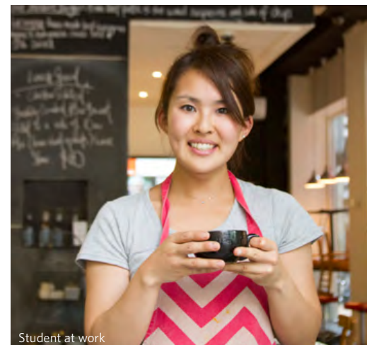
Student at work