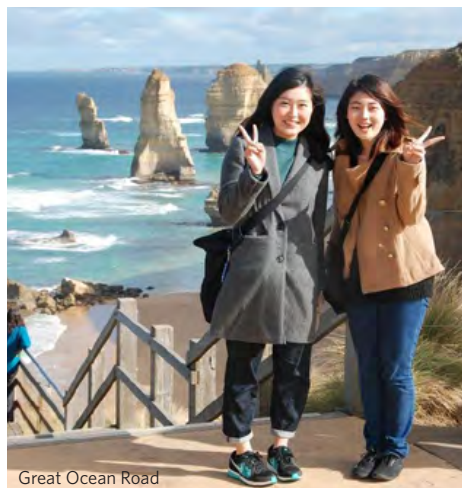
Great Ocean Road

Studying at Discover English not only means learning another language, it also involves new and rewarding experiences contributing to our society. I had the chance to participate in volunteering as a Japanese teacher. This experience helped me to understand how to teach others and use different learning methods. Moreover, my English improved faster since I was dealing with Australian students”.