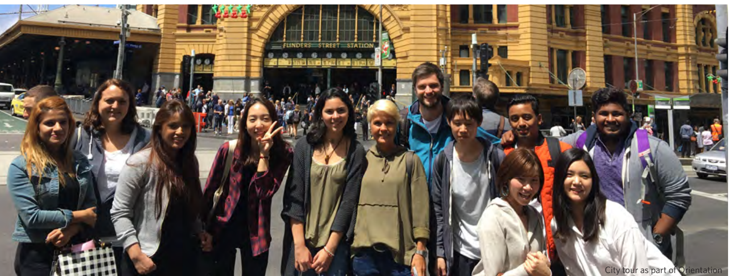
City tour as part of Orientation