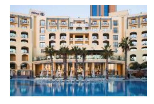
The Hilton Hotel

Students from 18 years old will be required to pay an Environmental Contribution amounting to €0.50c per night up to a maximum of €5 for each continuous stay in the Maltese Islands.