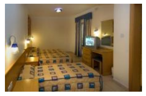
BAY VIEW HOTEL