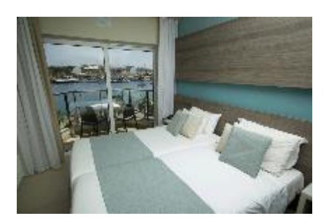
115 THE STRAND HOTEL