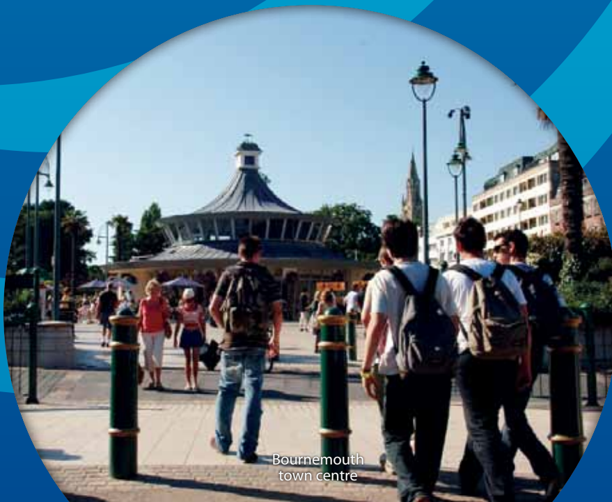
Bournemouth town centre