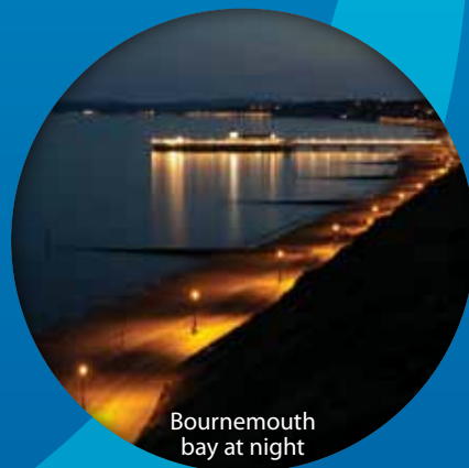
Bournemouth bay at night