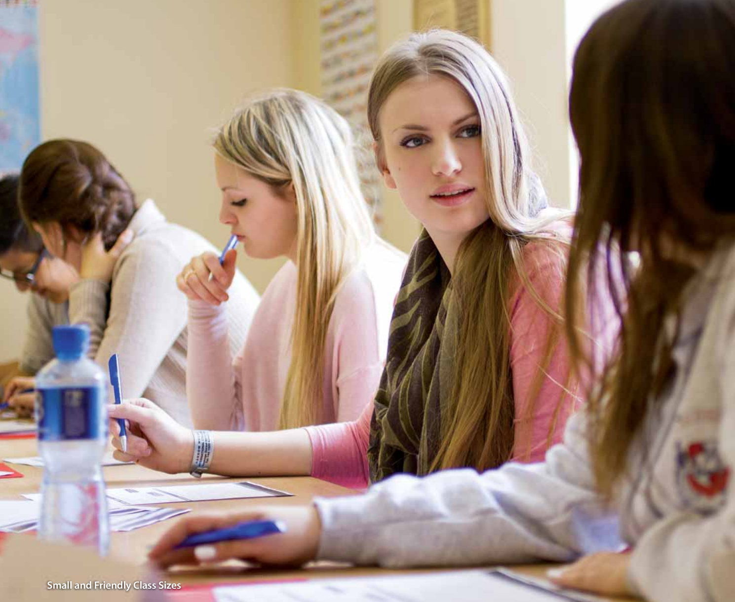
Small and Friendly Class Sizes