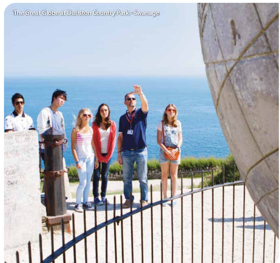
The Great Globe at Durlston Country Park - Swanage

The transfer time to Harrow House is approximately 2.5 hours from London Heathrow airport, 3 hours from Gatwick airport, 1.5 hours from Southampton and 1 hour from Bournemouth. Please see our website or supplementary manual for further details.