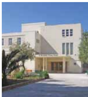
ESE San Gwann School