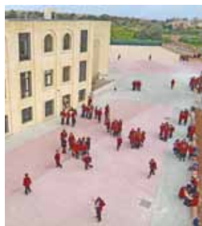
ESE Naxxar School