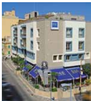
ESE Paceville School